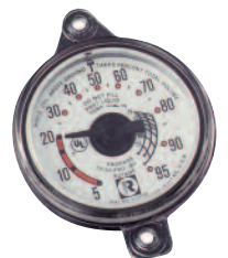
Junior Direct Reading