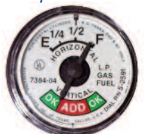
Snap-on Direct Reading