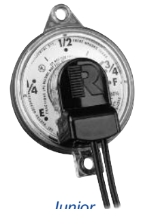
Junior Advanced Matrix TwinSite®