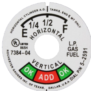
Dial S/A: 5714S02591

Conveniently located slots allow for easy removal of dial