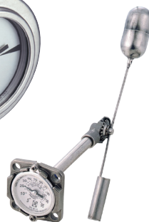
A6200 / A6400