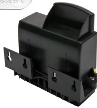
TEK 822 LPG Cellular Exi Monitor