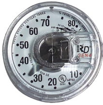
Gen 4 Dial

Features: Analog/Digital Outputs, Weatherproof, Snap-fit